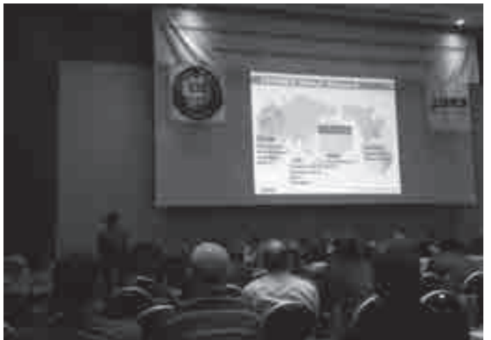
JSMEA members deliver presentations