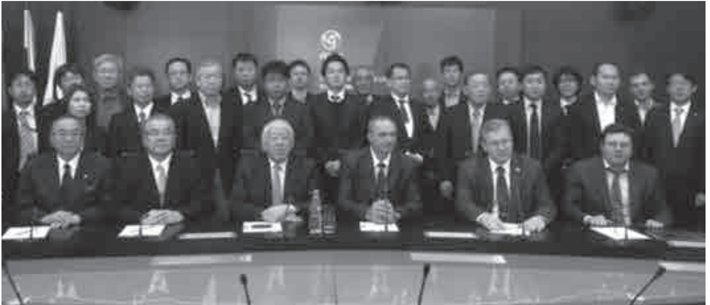
JSMEA mission visits FESRC