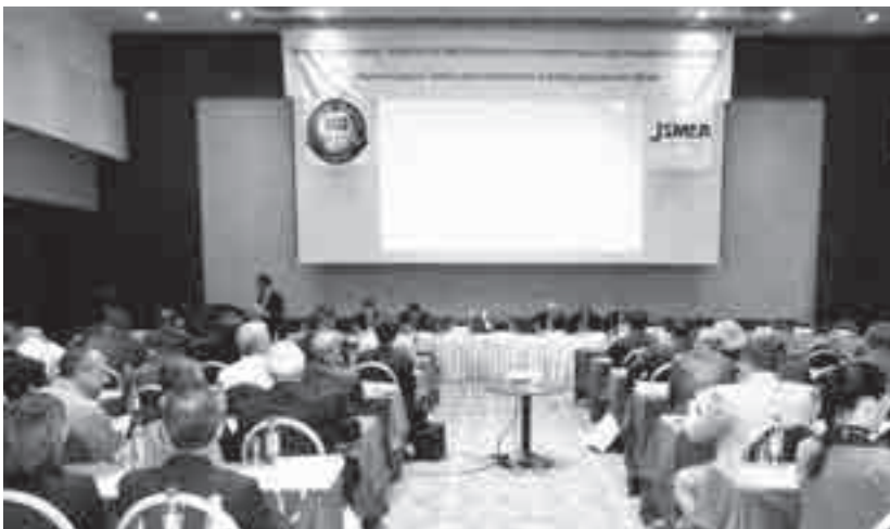
Seminar is fully attended