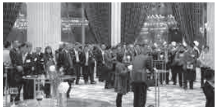
Many interested parties attend the get-together