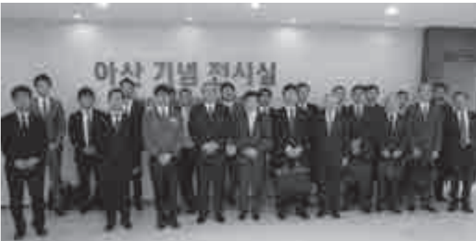
Members of JSMEA team and HHI staff members