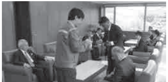
JSMEA team exchanges business cards with local partners