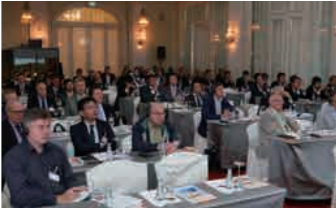
Many local parties are present at the JSMEA seminar.

Akasaka Diesels Ltd.; KEMEL Company, a division of Eagle Industry Co., Ltd.; Isodametal Co., Ltd.; Kawai Electronics Innovation (KEI) System Co., Ltd.; Makita Corp.; Daihatsu Diesel Mfg. Co., Ltd.; Teramoto Iron Works Co., Ltd.; Nakashima Propeller Co., Ltd.; Fuji Trading Co., Ltd.; Yamato Metal Co., Ltd. and Yanmar Co., Ltd.