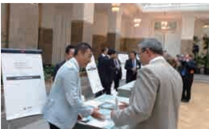
Booths are arranged at the reception hall for business talks.