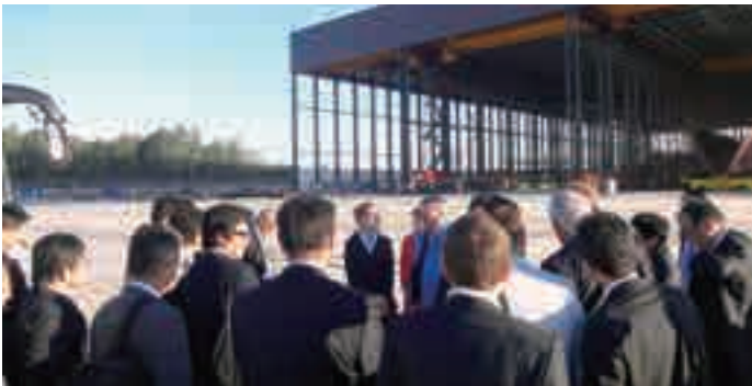
Pella Shipyard introduces its new facility to the JSMEA delegation.