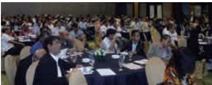
The JSMEA holds a ship machinery and equipment seminar.