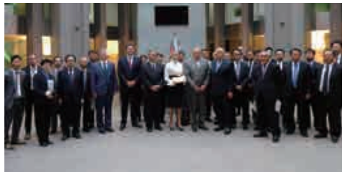
Members of the JSMEA delegation and employees of Sovcomflot gather for a memorial photo.