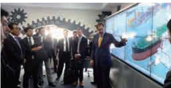
The JSMEA delegation receives a lecture on the Krylov State Research Centre.