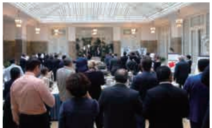
A reception is held after the seminar.