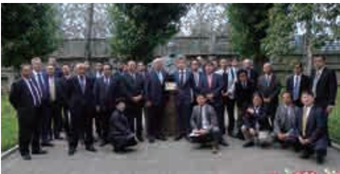
Members of the JSMEA delegation and employees of Pella Shipyard gather for a memorial photo in front of the shipyard.