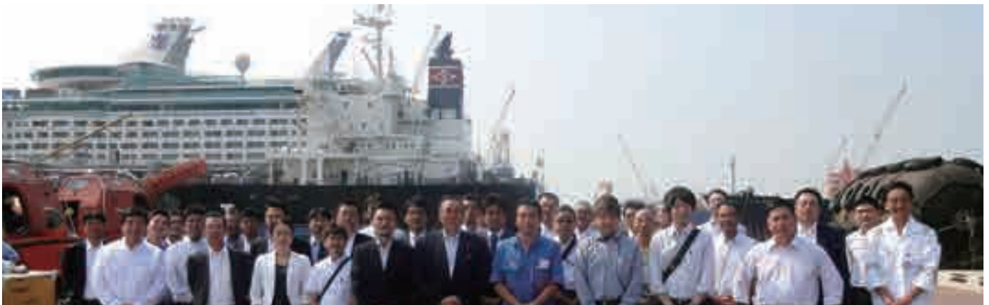
The JSMEA delegation visits Sembcorp Marine's Jurong Shipyard.

ISS Machinery Services Ltd.; Uzushio Electric Co., Ltd.; KEMEL Company, a division of Eagle Industry Co., Ltd.; KEI System Co., Ltd.; Kongo Colmet Mfg. Co., Ltd.; Shinagawa Forging Co., Ltd.; Shimada & Co., Ltd.; Teikoku Machinery Works, Ltd.; Teramoto Iron Works Co., Ltd.; Naniwa Pump Mfg. Co., Ltd.; Nabtesco Corporation; Matsui Corporation; Nippon Paint Marine Coatings Co., Ltd.; Japan Radio Co., Ltd.; Hien Electric Industries, Ltd.; Makita Corporation; Yamato Metal Co., Ltd. and NYK Trading Corporation