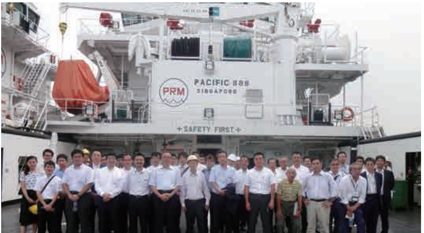
The JSMEA delegation visits Pacific Richfield Marine.