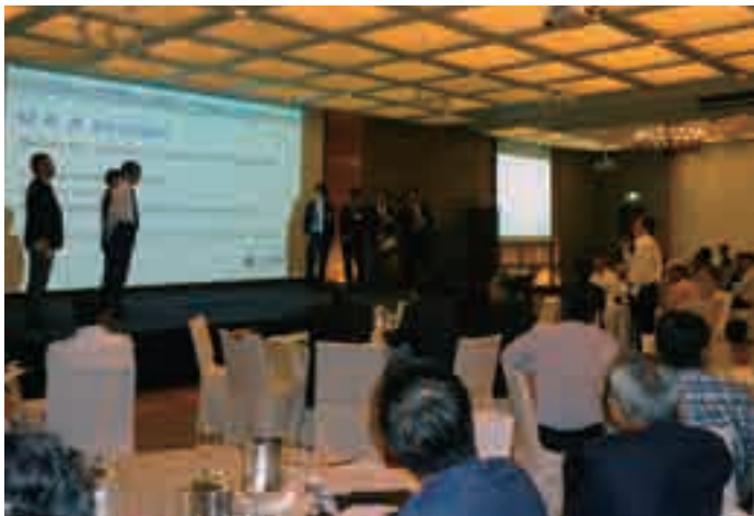
A question-and-answer session