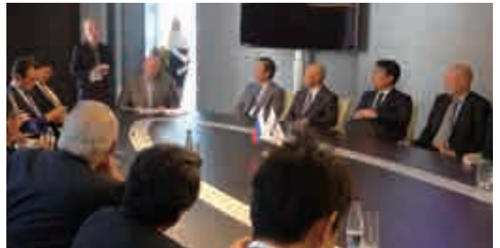
The JSMEA delegation learns about Sovcomflot.