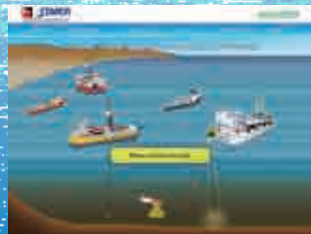
Top page of the Web site