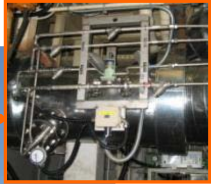
Reductant (Urea-Water) injection nozzle