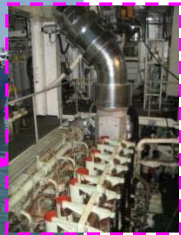
Under test engine